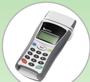
Chip & Pin Facilities