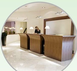
Hotel Leisure Clubs