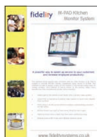
Kitchen Monitor System