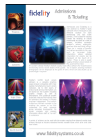
Admissions & Ticketing