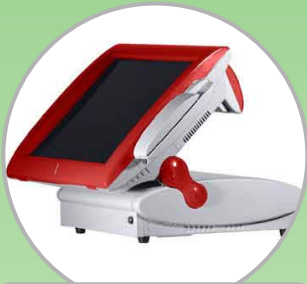
PC Touch Terminals

LeisureTouch Premium is an integrated touch screen based solution for the larger Leisure and Sports Centres. Modules include admissions, memberships, booking, marketing, bars and catering. Premium has all of the functionality of Corporate but is designed for a single location. Premium has KPI's (Key Performance Indicators), full graphical analysis and a report generator together with the customer status system.