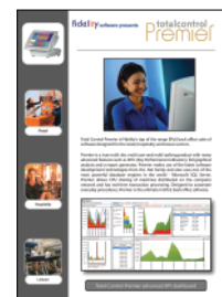
Total Control Premier